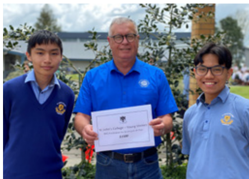
Young Vinnies present donation to St Vincent de Paul