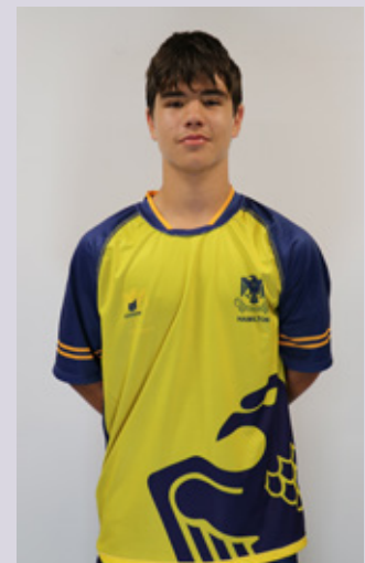
Reversible House colour