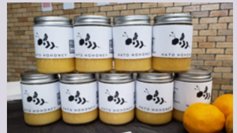
Very clever branding saw this delicious product sell out