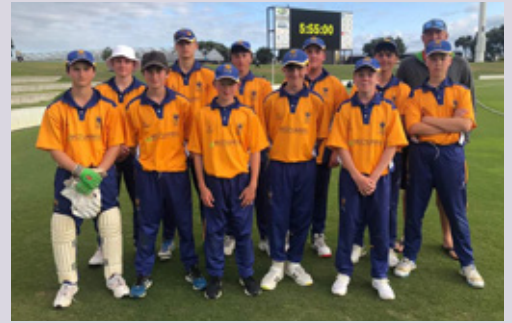
Colts Cricket played under lights at Bay Oval