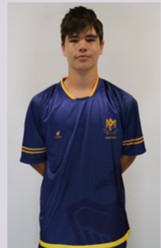
Revamped PE Uniform

The new shirts and shorts will be in stock at NZ Uniforms Hamilton in January. Our existing PE style may still be worn through 2023.