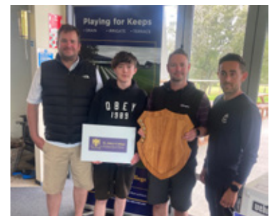
Winning golf team 'Higgins Hackers'