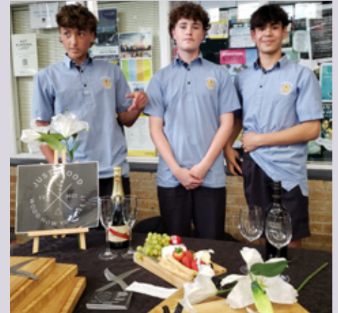
A handcrafted cheeseboard and knife was a steal at $25

A couple of pics from the Year 10 Enterprise Market place. Students created products for sale, and grateful staff and families snapped up an impressive array of cool eats, plants, scents and handcrafted gifts.