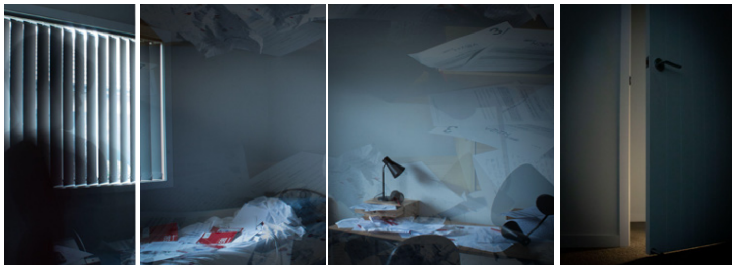
Coby Mateo's photography