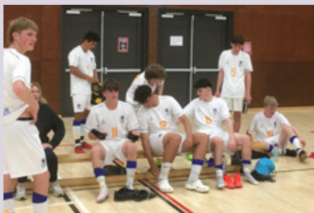
Futsal lads prepping for a game