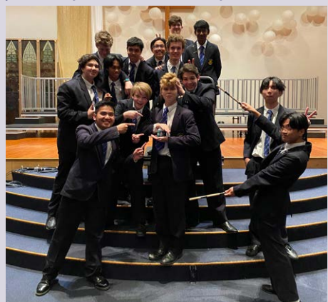
The Wingmen – Highly Commended

The Big Sing music festival is a choral competition held at the Holy Trinity Church in Tauranga. Our school choir 'The Wingmen' have been rehearsing twice a week in preparation to sing two songs to compete against 13 other schools in the Waikato/Bay of Plenty regionals. This year, The Wingmen performed to a very high level and attained the Highly Commended award for their performance, a step up from previous years. Well done boys.