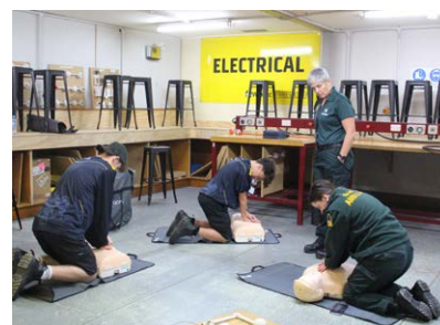
First Aid challenge