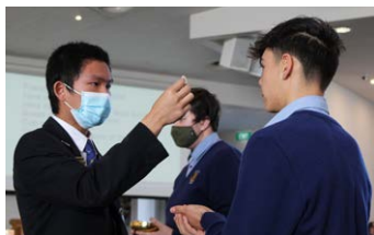
A student receives the sacrament of Confirmation