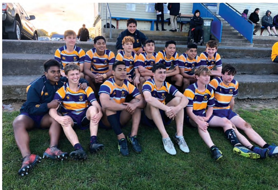
U15 Waikato 7's Champions