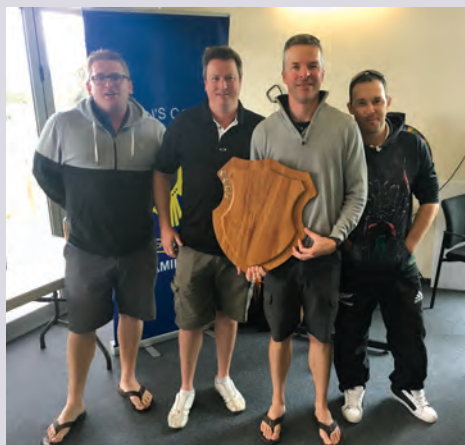
SJC Old Boys Golf Winners; Team West Coast