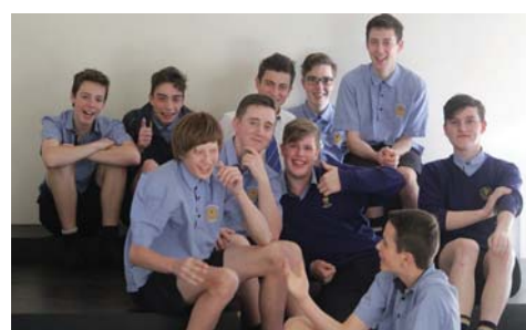
Senior and Junior Theatre Sports team

THEATRESPORTS RUNS EVERY TUESDAY BREAK TWO IN THE DRAMA ROOM - ALL ARE WELCOME TO EITHER PARTICIPATE OR SPECTATE.