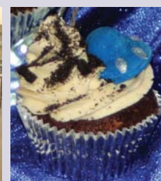
Antony Silich's cosmic themed cupcake