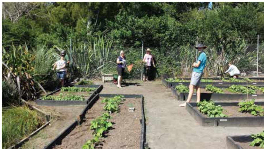
PTFA members hard at work at a Gully working bee

The PTFA organises working bees to support the Gully Native Forest Restoration Project, which was inaugurated in 2004 by the School Science Department as part of the Senior Agriculture and Horticulture course offered at the College. Only a few parents will know that its objective is to restore a sustainable native forest plant community stocked with native birds in the Gully between the College and the University so it is both an amenity for the community and an ecological area for the school.