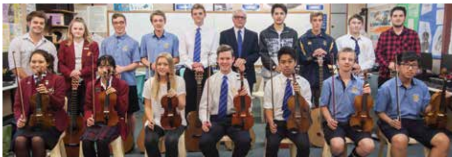
St John's College and Sacred Heart Students at St Patrick's Day celebrations