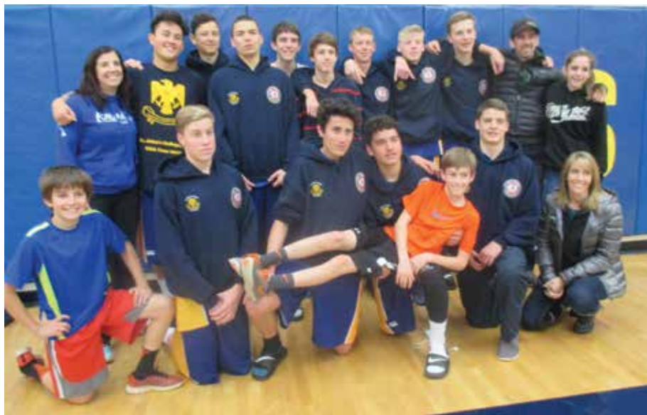
Top: St John's College and Costa Rica Teams after their games Bottom: The Junior Eagles with their host families

A St John's basketball tour party of 25 players and 14 adults left New Zealand for America in early December to compete in a number of prestigious tournaments and high school games.