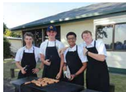
Helping out with the Year 9 Welcome BBQ

During the first few weeks of the new school year the annual Leadership Retreat was held at Waikato University. The camp was held over two days and is designed to introduce Year 13 students to leadership skills. This was achieved by students participating in a personality quiz which determined varying strengths, attributes and personality types. The students were then grouped by their personality type derived from the quiz and presented how each unique trait would contribute to each individual becoming a great leader within the school.