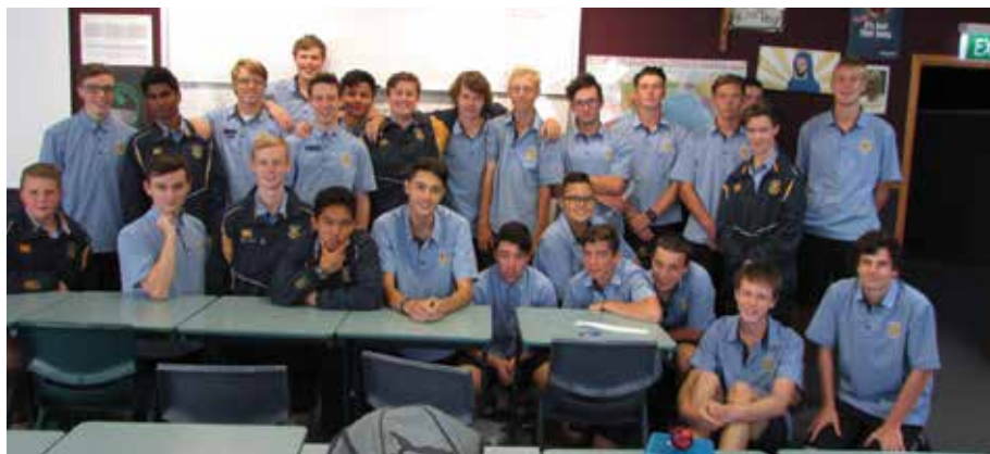
Some of the 2016 Tuakana

The Māori word for “older brother” is Tuakana and it’s a title that holds respect here at St. John’s College. Thirty-nine Year 12 students were chosen from a pool of about sixty boys at the end of 2015. Students needed to fill in an application about what strengths they would bring to the role of Tuakana if they were selected.