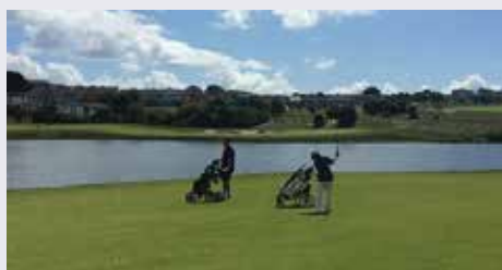
Golf Exchange Teeing off