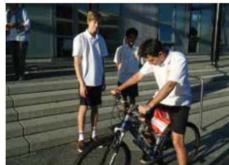
Right: Building an electric bike in an hour at the launch evening

Three teams from the Year 13 Materials Technology class competed against other secondary schools at the Wintec hosted Evoloccity launch in March to build an electric bike. Evoloccity is a charity dedicated to educating kiwis on the environmental and economic benefits of electric vehicles and growing youth interest in engineering and technology. The St John's teams have been working with Waikato University Engineering Department and have received coaching and mentoring from Old Boys of St John's who now work for Stafford Engineering.