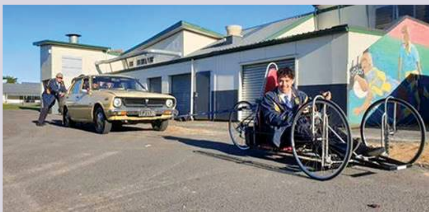
The future is towing the past