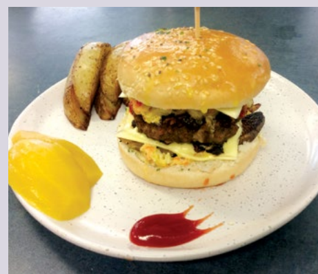
"Human Fuel" Winning burger