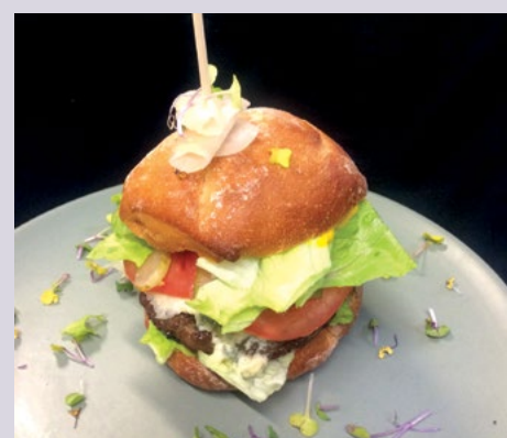
"Chilli Blue Cheese Burger" Runner Up