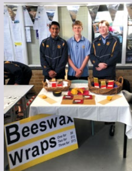
Beeswax Wraps - just one of the products on sale at the Y10 Trade Fair